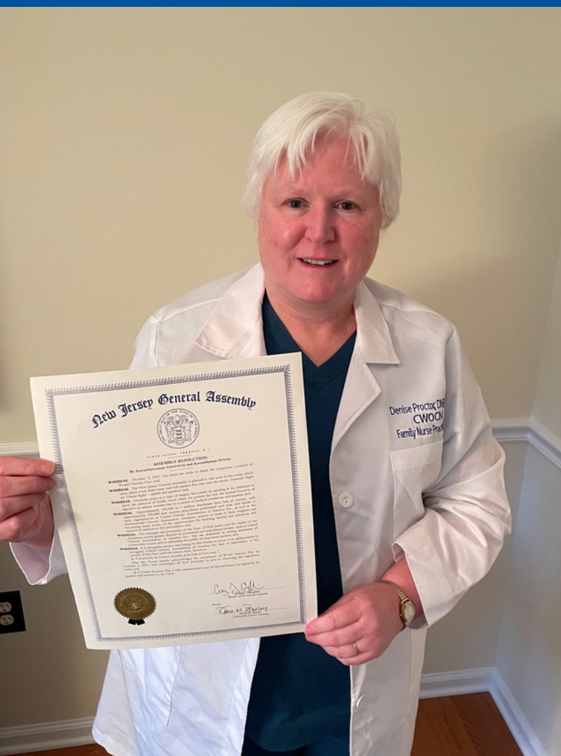
NJ advocate with proclamation declaring World Ostomy Day