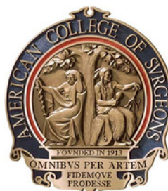
American College of Surgeons