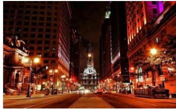
Avenue of the Arts South Broad Street (0.8 mi.)

The Barnes Foundation in Philadelphia is home to one of the world's greatest collections of impressionist, post-impressionist and early modern paintings. More information at www.barnesfoundation.org/