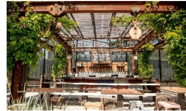
Pop-up Beer Gardens

The Avenue of the Arts is Philadelphia's signature street. It has grown to become the heart of our city aesthetically, socially, economically, and culturally. The Avenue is one of the most vibrant and successful performing arts, residential, educational, commercial, and tourist destinations in the United States. See what's going on at www.avenueofthearts.org