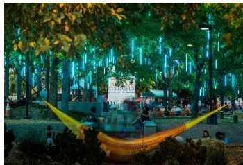
Spruce Street Harbor Park 301 S Christopher Columbus Blvd (2 mi.)

When it comes to places to take pictures in Philadelphia, our viewtiful sights are second to none. See the city light up like never before right from our observation deck. More information available at www.phillyfromthetop.com