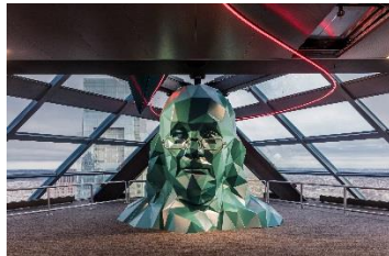
One Liberty Observation Deck 1650 Market St #5700 (0.3 mi.)

When it comes to places to take pictures in Philadelphia, our viewtiful sights are second to none. See the city light up like never before right from our observation deck. More information available at www.phillyfromthetop.com