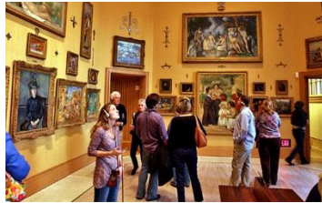
The Barnes Foundation 2025 Benjamin Franklin Parkway (0.4 mi.)

Sheraton Philadelphia Downtown Hotel 201 North 17 th Street, Philadelphia, PA 19103